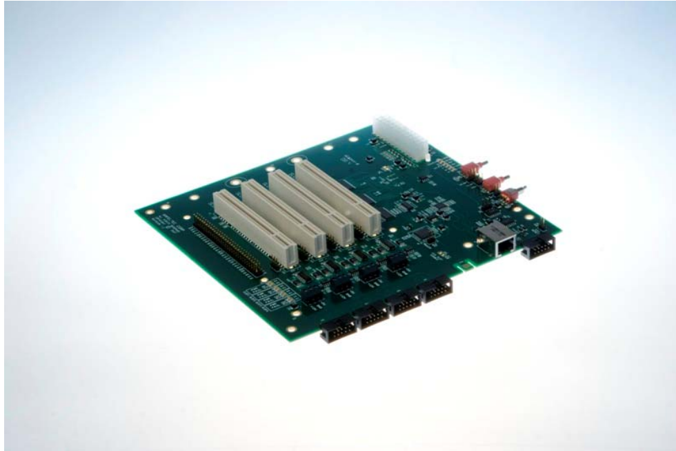
Figure 1: PCI Expansion Backplane