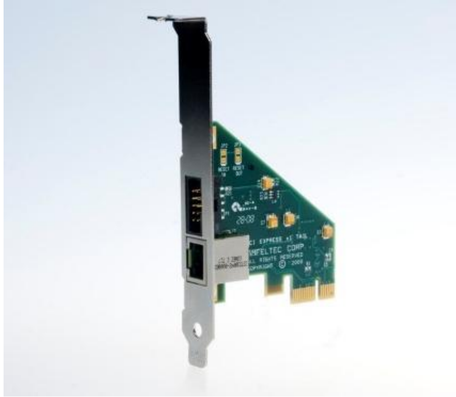
Figure 2: PCI express Host Card