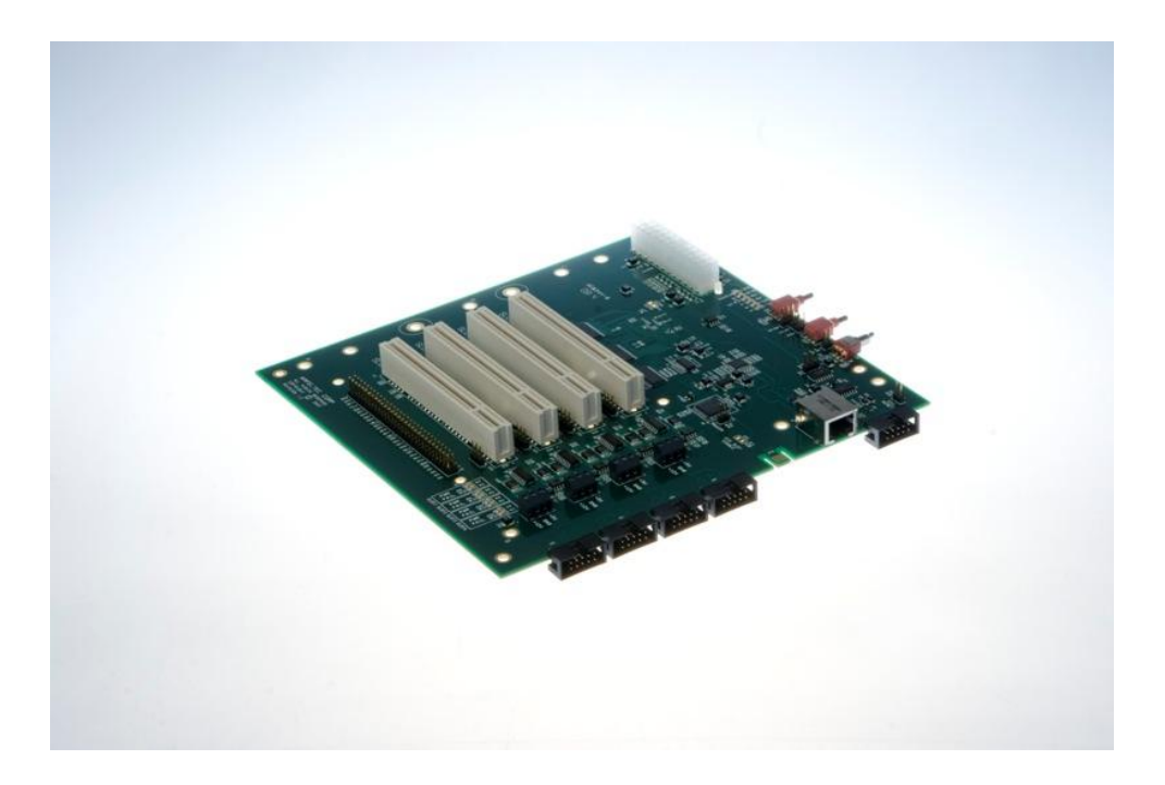
Figure 1: PCI Test Backplane