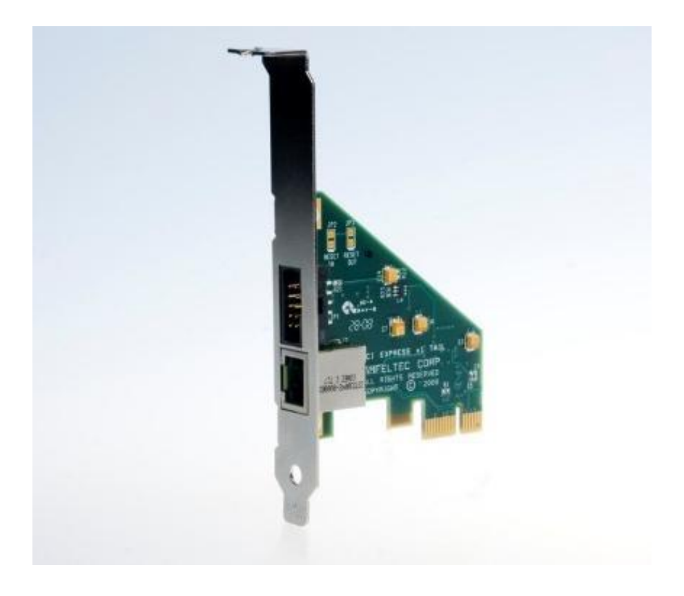
Figure 2: PCI express Host Card